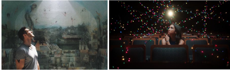
Art & Krimes by Krimes, Disfluency