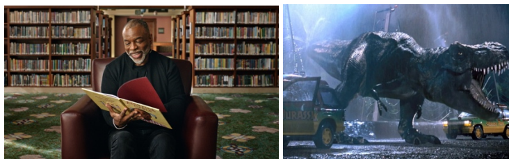
Butterfly in the Sky, Jurassic Park