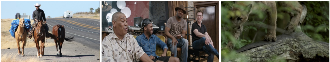
The Long Rider, Take Me to the River New Orleans, Path of the Panther