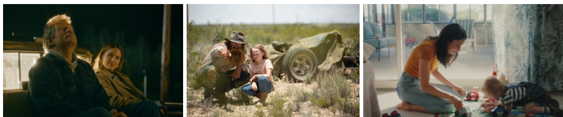
Acidman, The Big Bend, Disfluency

Films in the Naples International Film Festival's competition categories will be vying for more than $10,000 in prizes, including the Audience Awards for Best Narrative Feature, Best Documentary Feature and Best Short as well as the Focus on the Arts Award, given to a Narrative or Documentary film with an emphasis on one or more of the visual or performing arts. For the fourth consecutive year, there will also be juried awards in the Narrative and Documentary features categories.